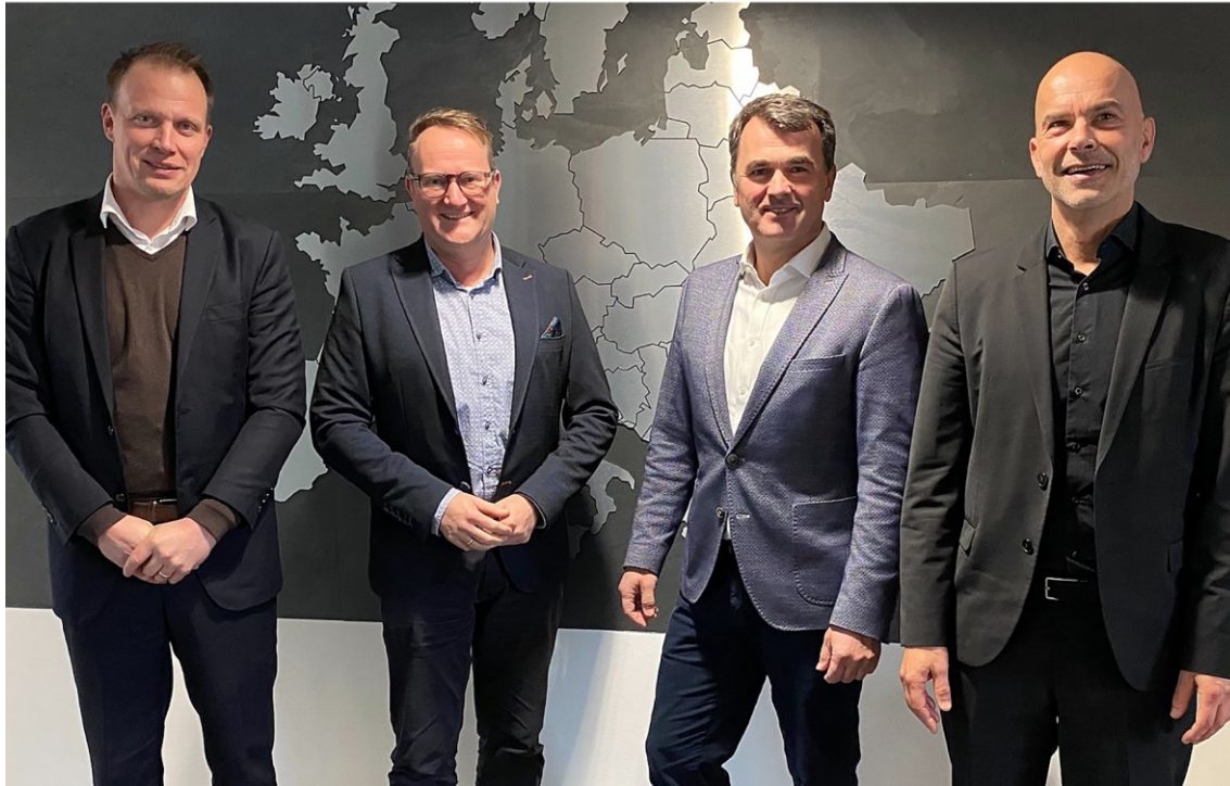
Figure 1: Heliatek and IGEPA group representatives at the signing of the partnership agreement